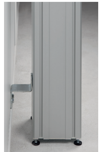
Levelling feet and 2 wall mounting brackets for optimum stability