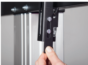
Pull & release locking brackets for easier mounting of display