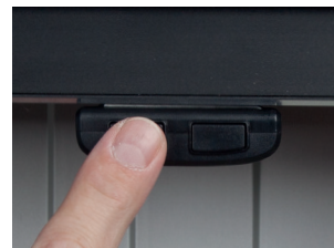
Wired remote control included