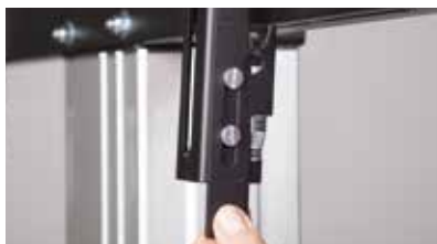
Pull & release locking brackets for easier mounting of display