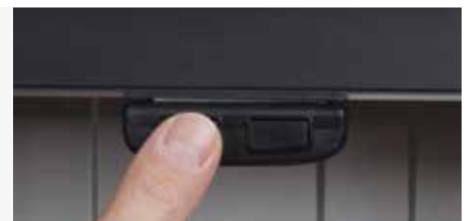
Wired remote control included