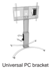
Universal PC bracket