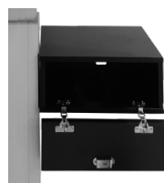
Lockable notebook cabinet