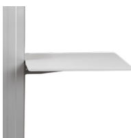
Side shelf for laptop